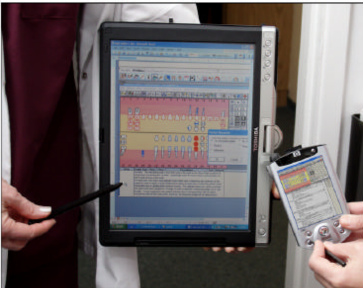
Figure 2 Computerized Treatment Notes Without Typing: Easy Notes Pro ( www.EasyNotesPro.com ) allows you to enter your treatment notes by just tapping the computer screen with a stylus – no typing necessary! Fast, easy, fully customized, correctly spelled ... and legible!

the email address into the computer only once but the computer uses it many times, automatically confirming each appointment the patient makes.