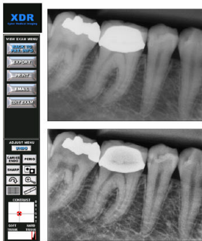
Figure 1: Rapid X-Ray Enhancement:

Digital X-Rays: Digital x-ray is increasing rapidly in dentistry. It lowers overhead, is faster, eases the burden on the environment, and can be far more diagnostic than conventional film. Good radiology software allows us to see things that were invisible on even the most sensitive, most accurately exposed and most meticulously processed film. (Figure 1) But there is a common misconception that our digital radiography software and our PMS must come from the same software company in order to be “integrated.” Not true! We can get the best solutions available from different vendors rather than a compromised, cobbled together conglomeration. Management software features and radiology software features have nothing in common so it is not surprising that the “best” product of each type would come from different companies. Now virtually any radiology software can be linked to virtually any PMS with the same level of practical integration. For example, XDR X-Ray ( http://www.xdr-radiology.com ; (888) 937-9729) (excellent radiology software, in my opinion) includes a free built-in “link” that allows it to fully integrate with all the major PMS programs. One mouse click is all that is required to